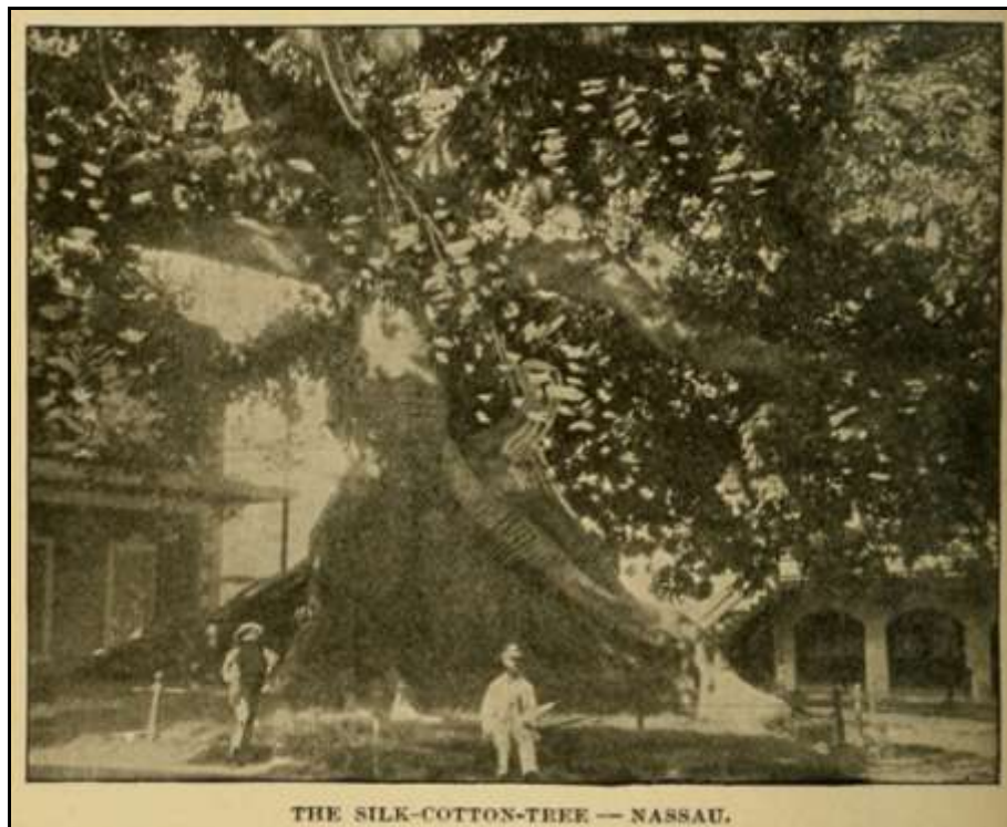
BS NSCT 9.

1888 F. A. Ober, named special commissioner to the West Indies for the Chicago World Columbian Exposition, visited Nassau in 1888 and proclaimed the “magnificent silk-cotton in the court-house yard” as one of the must see “attractions.” (p. 115). His photograph of the tree and two men shows the pipe/chain enclosure (p. 114).