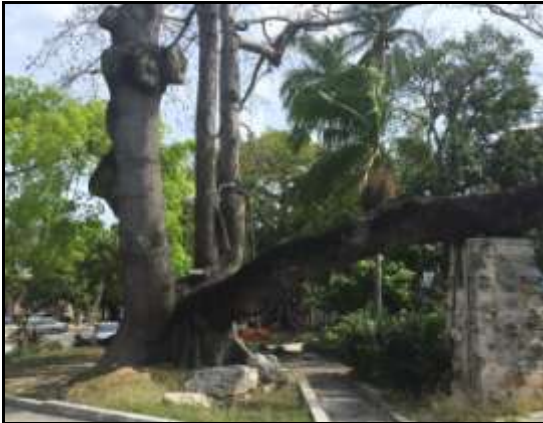
BS RVH 6.

Our photograph of April 2019 shows very little change during the last 120 years. Both views to the north. In the Havens' photograph the dome of the library can be seen, left center.