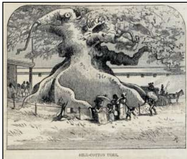
BS NSCT 7.

1883 Lady Anna (Annie) Brassey (1839-1887) was an English travel writer who married a member of Parliament and sailed around the world on their yacht Sunbeam . While in Nassau in November 1883 she wrote that "In the grounds outside the library are the huge silk-cotton tree and the remains of the old banyan tree." (p. 346) An illustration, from an engraving on wood, shows the Lady sitting in front of the silk cotton tree (p. 345).