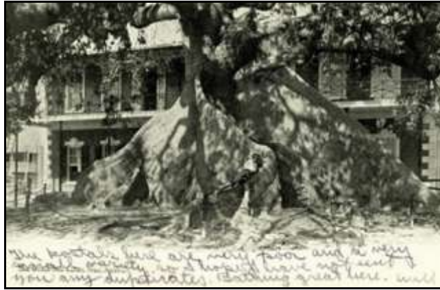
BS NSCT 20.

1904 circa. A postcard in the collection of the University of San Diego, dated March 14, 1905 depicts the tree, probably photographed the previous year, by an unknown photographer.