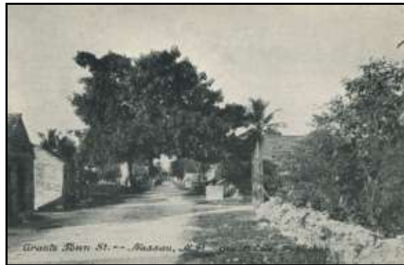
BS Grant's Town. Postcard by George M. Cole, 1902.

On Cat Island, at Bight Village, in 1920 (Britton and Millspaugh 1920: 274-5) saw "a large silk cotton tree . . . however, it shows no evidence of successful regeneration." And the large highway marker tree at Central Palmetto Point on Eleuthera is famous.