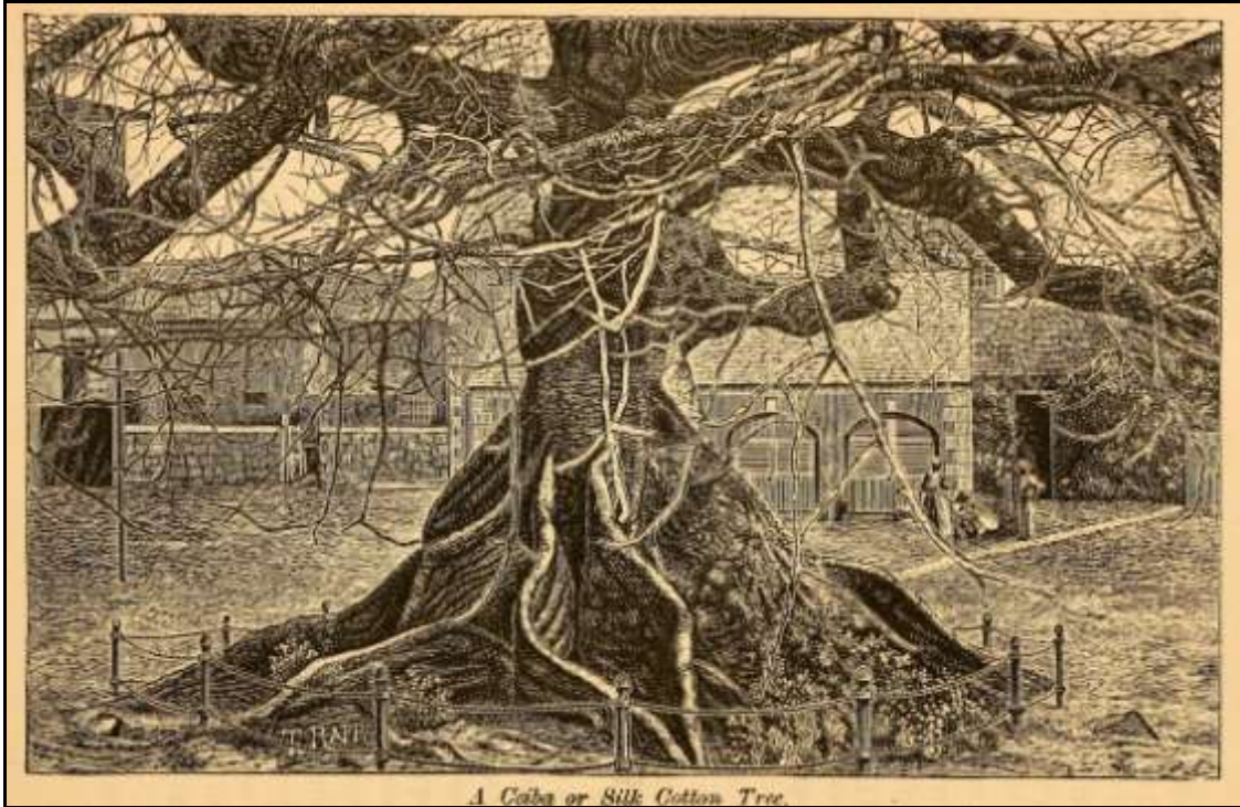
BS NSCT 6. "A Ceiba or Silk Cotton Tree," Engraving by T. Rapp (TRAPP?).

1883 Lady Anna (Annie) Brassey (1839-1887) was an English travel writer who married a member of Parliament and sailed around the world on their yacht Sunbeam . While in Nassau in November 1883 she wrote that "In the grounds outside the library are the huge silk-cotton tree and the remains of the old banyan tree." (p. 346) An illustration, from an engraving on wood, shows the Lady sitting in front of the silk cotton tree (p. 345).