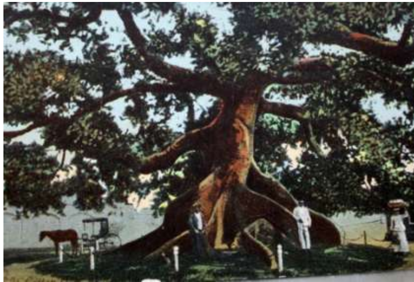
BS NSCT 14.

1893 Book Plate Prints, Port-of-Spain, Trinidad, Nassau, Bahamas , p. 461. The photograph “Silk-cotton tree, Nassau, Bahamas” comes from the collection of the Royal Photograph Gallery. The author claims “this tree is the monarch of all trees on the island.” This photograph was also published in 1904 by the journal Forest Leaves (Souder 1904: 134). Another edition “Bahama Islands, Nassau, New Providence, Silk Cotton Tree,” can be seen in the collection of the Reading (PA) Public Museum and Art Gallery.