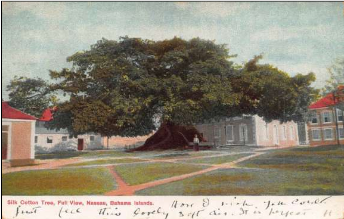
BS NSCT 22.

1910 Northrop (1910: 121) noted silk cotton trees in the parks (p. 1) and at Ryswick, three miles from Nassau shore.