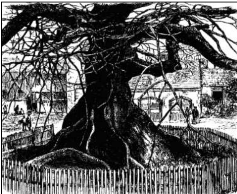
BS NSCT 5.