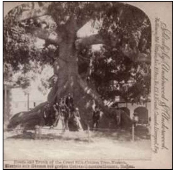
BS NSCT 2. Photograph of Fred Case, ca. 1870. BS NSCT 3. "Roots and Trunk of the Great Silk Cotton Tree, Nassau." "Burzein und Stammes grossen Geidens Baumwollbaums, Nassau."

1875 Epes Winthrop Sargent (1813-1880), a Nassau-born man, published an engraving by Abbey based on a photograph. The famous tree is shown enclosed with a picket fence and a lone man walking in foreground (1876a: 12).