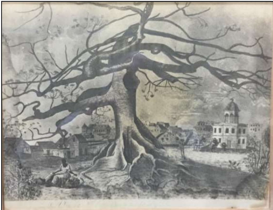
BS NSCT 1. "A view of a silk-cotton tree on the island of New Providence, Bahamas, March 12, 1802." (view to south, domed building is the old jail and the current library).

However, the oral tradition of an early 1700s silk cotton tree in Nassau does give supporting evidence for the date of 1802 for the earliest illustration, given the size and obvious age of the tree in the drawing.