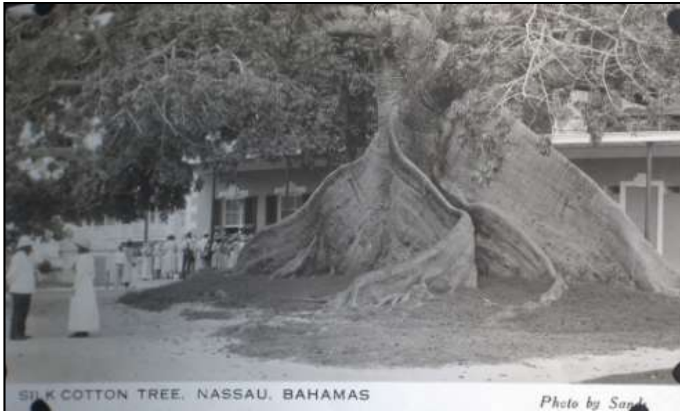
BS NSCT 26.