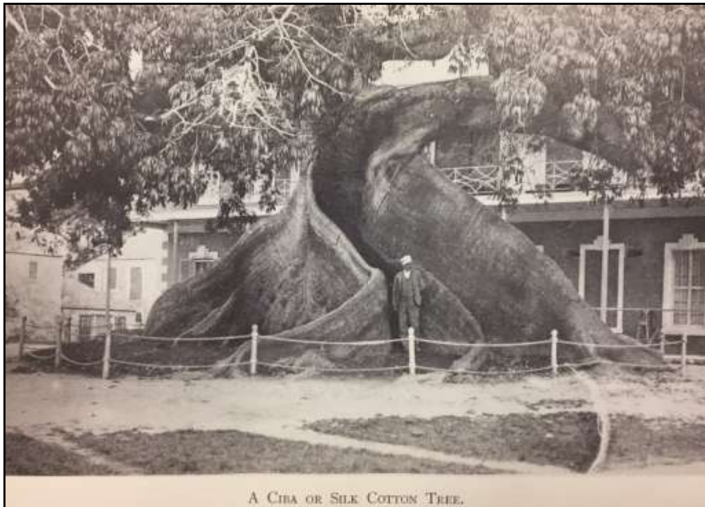
BS NSCT 11. Stark 1891: 173.

1891 James H. Stark published the "Map of Nassau 1891" (pp. 116/117) that was drawn by the office of the Surveyor General in Nassau. This is perhaps the earliest map to place the tree amongst the government buildings of Nassau: "Bombax ceiba Gt. silk cotton tree." It is located north of Shirley Street and east of Parliament. While Stark does not mention the tree in his text, he does include two photographs (pp. 113, 173).