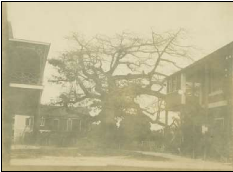
BS NSCT 21.

1906 Franklin Davenport Edmunds (1874-1948), an architect from Philadelphia, mislabeled the famous tree as an “old cottonwood tree, Nassau, Bahamas.”