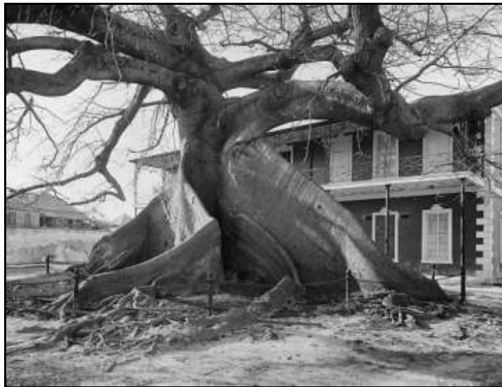
BS NSCT 15. Photograph of William H. Jackson, 1901.