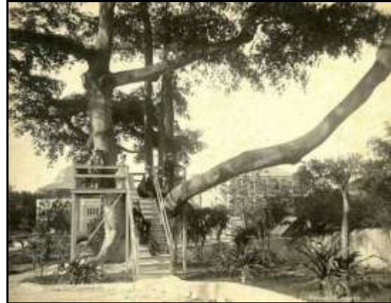
BS RVH 7. By O. Pierre Havens, ca. 1900.

Other photographs of the hotel and its silk cottons can be seen in the Caribbean Photo Archive via flickr.