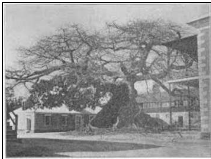
BS NSCT 19.

Howe is credited with placing the appropriate title on the sketch in the public library at Nassau representing "A view of a silk-cotton tree on the island of New Providence, Bahamas, March 12, 1802."