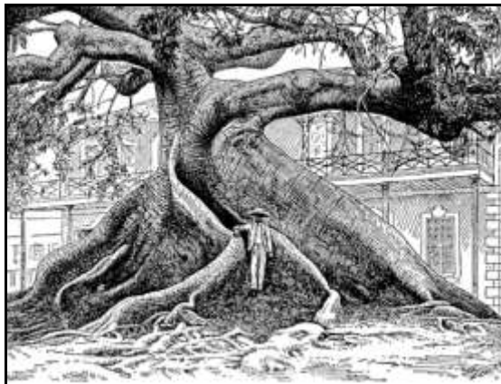
BS NSCT 25. "Ceiba Casearia, the great silk-cotton tree at Nassau."

1914 Worldwide praise for the Nassau tree was followed by recognition in the "Standard Cyclopaedia of Horticulture" (Bailey 1930 edition, vol. I: 700). The selected example of the ceiba pentandra , worldwide, was the engraving below.