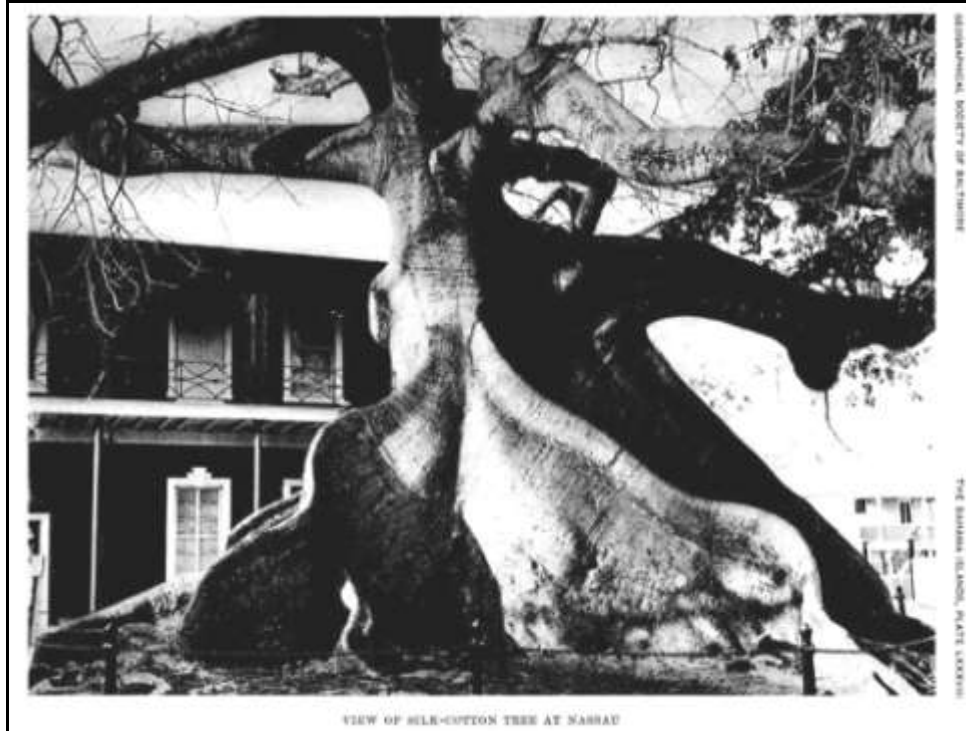
BS NSCT 18.