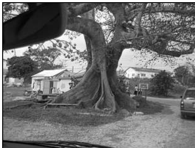
BS Eleuthera Island silk cotton.

On Cat Island, at Bight Village, in 1920 (Britton and Millspaugh 1920: 274-5) saw "a large silk cotton tree . . . however, it shows no evidence of successful regeneration." And the large highway marker tree at Central Palmetto Point on Eleuthera is famous.