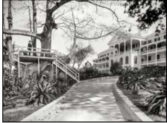
BS RVH 4, 5. Photographs of W. H. Jackson, 1901.

When the hotel closed in 1971 at least seven silk cottons still remained on the grounds.