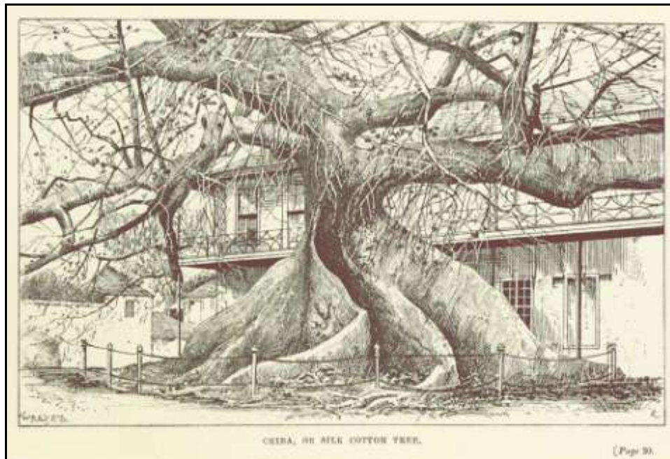
BS NSCT 8.