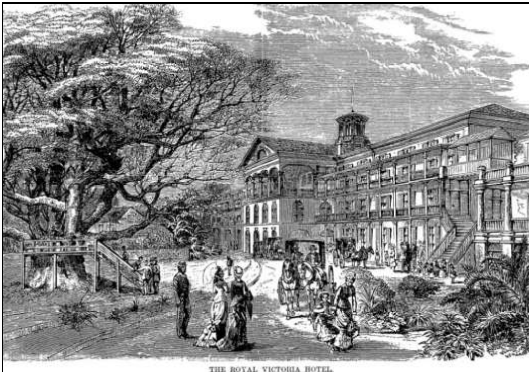
BS RVH 1. The hotel with stairs unto the largest silk cotton. View to east (Sargent 1876b: 25).

Several trees photographed during the late 1800s can be recognized in our photos in April 2019.