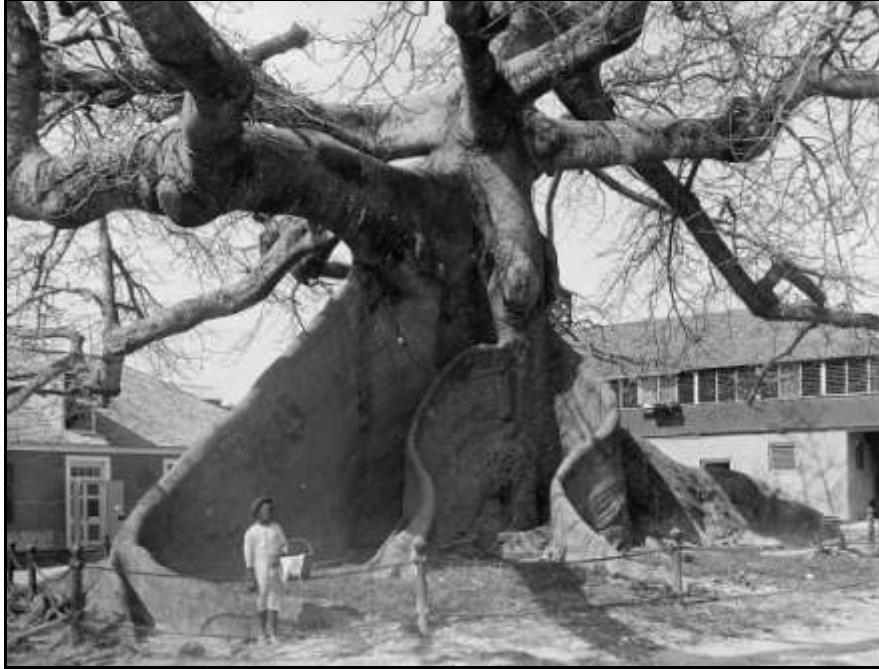
BS NSCT 16. Photograph of William H. Jackson, 1901.