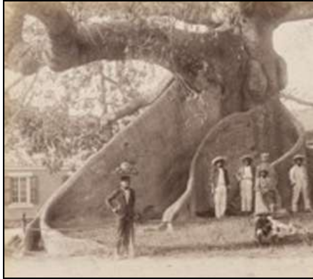
BS NSCT 10.

1891 James H. Stark published the "Map of Nassau 1891" (pp. 116/117) that was drawn by the office of the Surveyor General in Nassau. This is perhaps the earliest map to place the tree amongst the government buildings of Nassau: "Bombax ceiba Gt. silk cotton tree." It is located north of Shirley Street and east of Parliament. While Stark does not mention the tree in his text, he does include two photographs (pp. 113, 173).