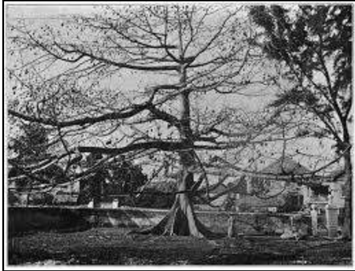
BS The Asylum, Nassau, 1905.

And historically, the grounds of The Hermitage (Nassau) and Grant's Town have been sites known for their silk cottons.