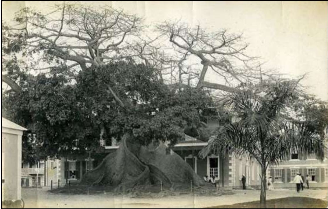
BS NSCT 24.

1911 In the four volume compilation of The Wonders of the World , H. H. Johnston, et al. presents the "Silk Cotton Tree, Bahama Islands -- the finest and most perfect known is that at Nassau, situated behind the Post Office." (vol. 3, p. 526). The photograph reproduced on p. 527 is that of William H. Jackson, from 1901, published by the Detroit Photographic Company.