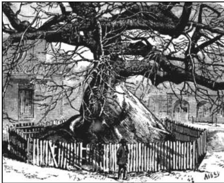
BS NSCT 4. Copy, New York Public Library.

1875 Epes Winthrop Sargent (1813-1880), a Nassau-born man, published an engraving by Abbey based on a photograph. The famous tree is shown enclosed with a picket fence and a lone man walking in foreground (1876a: 12).