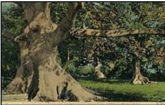
BS Hermitage. Postcard, no date.

And historically, the grounds of The Hermitage (Nassau) and Grant's Town have been sites known for their silk cottons.