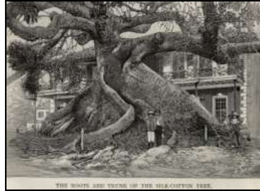
BS NSCT 12, 13.

1893 Book Plate Prints, Port-of-Spain, Trinidad, Nassau, Bahamas , p. 461. The photograph “Silk-cotton tree, Nassau, Bahamas” comes from the collection of the Royal Photograph Gallery. The author claims “this tree is the monarch of all trees on the island.” This photograph was also published in 1904 by the journal Forest Leaves (Souder 1904: 134). Another edition “Bahama Islands, Nassau, New Providence, Silk Cotton Tree,” can be seen in the collection of the Reading (PA) Public Museum and Art Gallery.