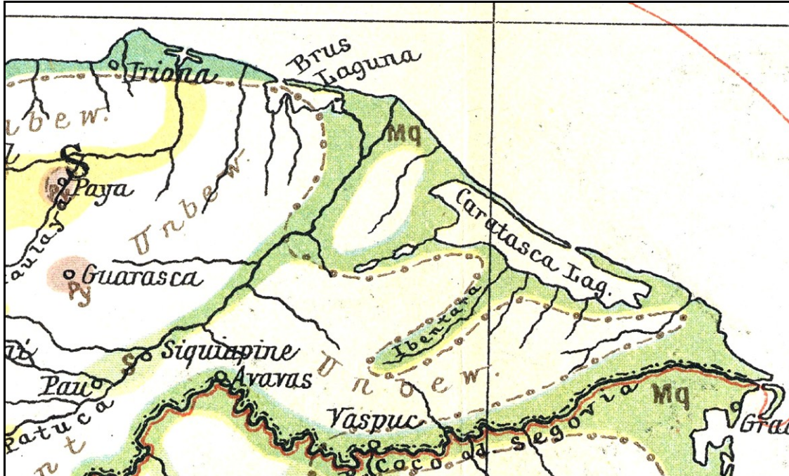
Figure 2. Sapper's Language Map of Honduras, Mosquitia portion, 1901.

The census indicates that the indigenous folks retain their religion and languages. All ladinos spoke Spanish and were Catholics. The sole Protestant was the English-speaker (Yngles) from Belice. A few ladinos had been vaccinated and some could read and write.